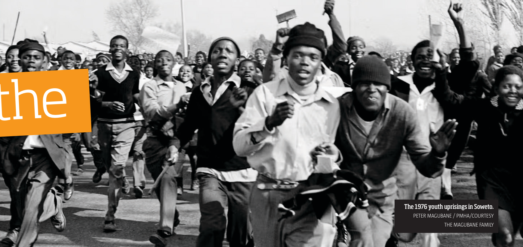
The 1976 youth uprisings in Soweto.

Journalists have played a crucial role in exposing the ‘state capture’ that overshadowed the presidency of Jacob Zuma, in which the billionaire Gupta brothers siphoned off huge sums of public money through lucrative public sector contracts and arrangements.