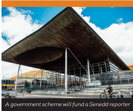
A government scheme will fund a Senedd reporter

The estimated cost of establishing the institute is £1m.