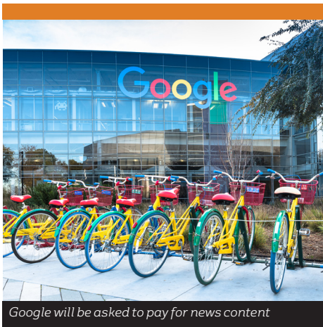
Google will be asked to pay for news content

The union's route map to tackle the effects of the Covid-19 crisis on the industry and reconfigure it so it is grounded in the public interest is winning support among politicians and the media.