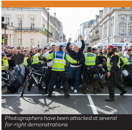
Photographers have been attacked at several far-right demonstrations

in Northern Ireland were routinely threatened by paramilitary groups, with an offshoot of the Ulster Defence Association recently targeting all the staff of the Sunday Life and Sunday World in Belfast. She reported incidents of unacceptable and abusive behaviour from the British police, matters since raised directly with the National Police Chiefs' Council.