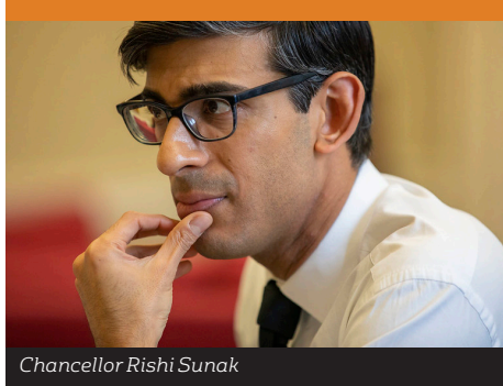
Chancellor Rishi Sunak

"This crisis should act as a wake-up call on the working practices of journalists and other freelancers in the