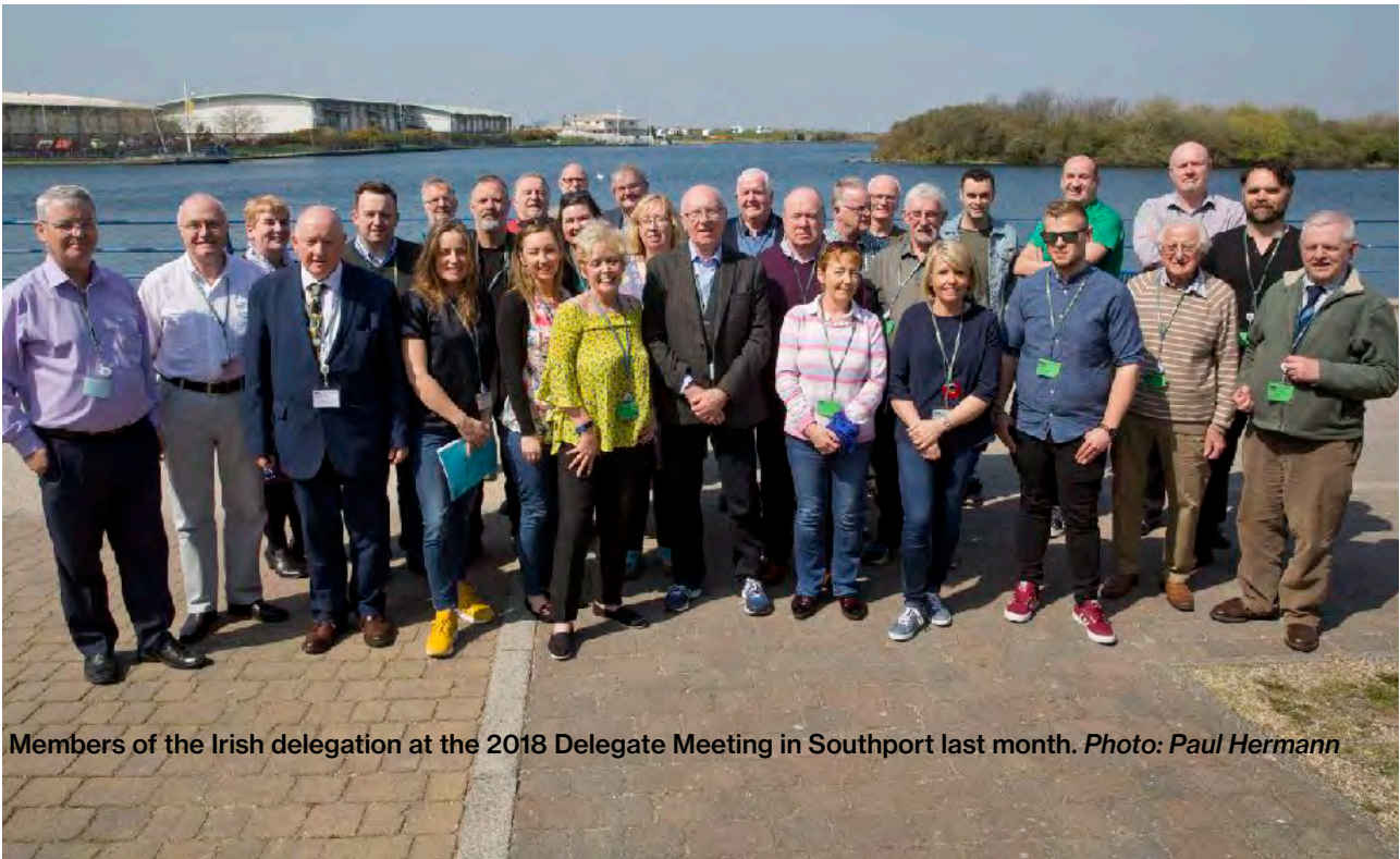
Members of the Irish delegation at the 2018 Delegate Meeting in Southport last month.