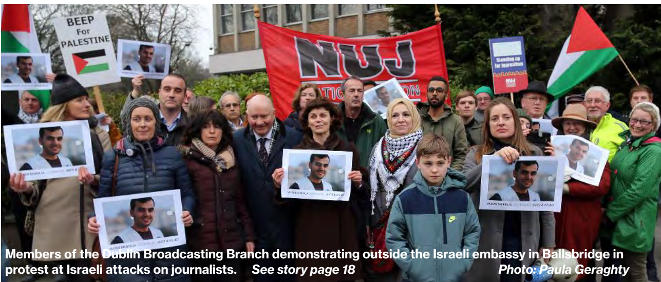
Members of the Dublin Broadcasting Branch demonstrating outside the Israeli embassy in Ballsbridge in protest at Israeli attacks on journalists. See story page 18